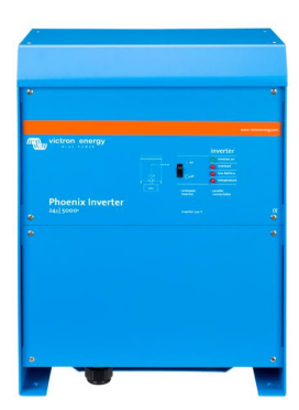
Phoenix Inverter 24/5000